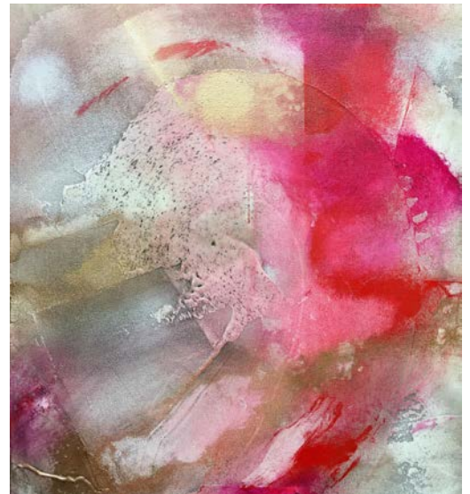
Chasing the Light