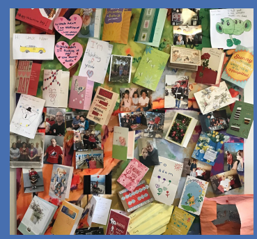
The incredible outpouring of support on Adam's Hospice room wall