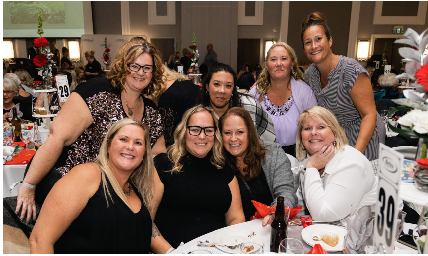
2 | HANDBAGS FOR HOSPICE 2023

Stedman Community Hospice is well known throughout the community for its exceptional team of doctors, nurses, PSWs, grief and bereavement staff, and volunteers, who ensure compassion, dignity and respect are central to all we do.